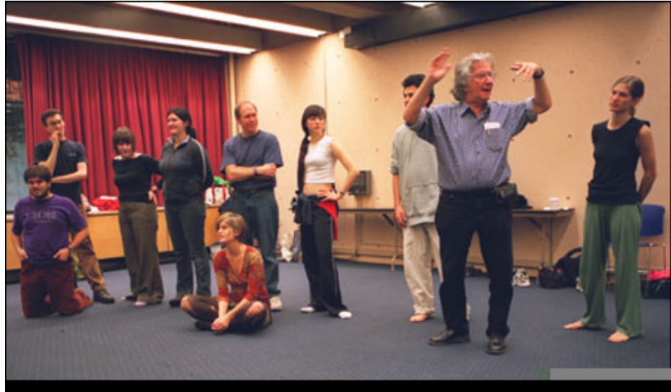
Boal (arms raised) conducts a movement exercise.

While the words "Theatre of the Oppressed" may suggest something heavy and dirge-like, Boal's presence soon dispels such preconceptions. Buoyant and encouraging, his face framed by an unruly silver mane, he quickly connects with the participants in his workshop through a series of stories whose implications seem to go beyond their apparent simplicity.