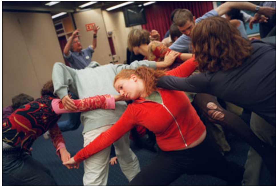
Brazilian artist/activist Augusto Boal is visiting Harvard to conduct theater workshops.